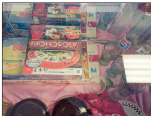
Some of the Silent Auction items displayed